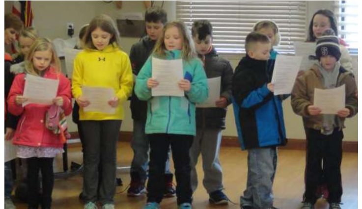
2nd grade students from Exira-Elk Horn-Kimballton came to sing songs to the residents.