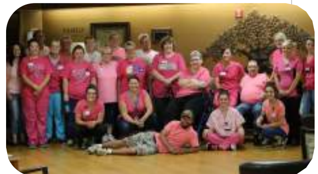
Several staff like to join in on the fun of PINK Fridays.