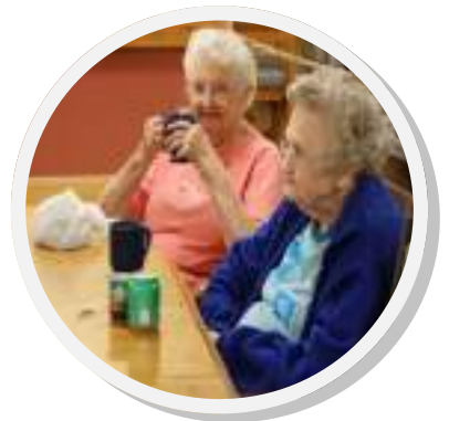
Residents enjoying afternoon coffee time.