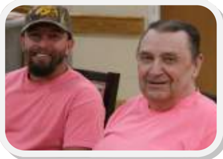
Tough Guys Wear Pink!