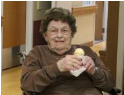
Residents enjoy ice cream cones!!