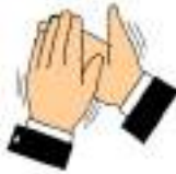
Van Ride to "Alice in Wonderland" High School Musical—Dress Rehearsal