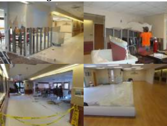
Dining Room Renovation...