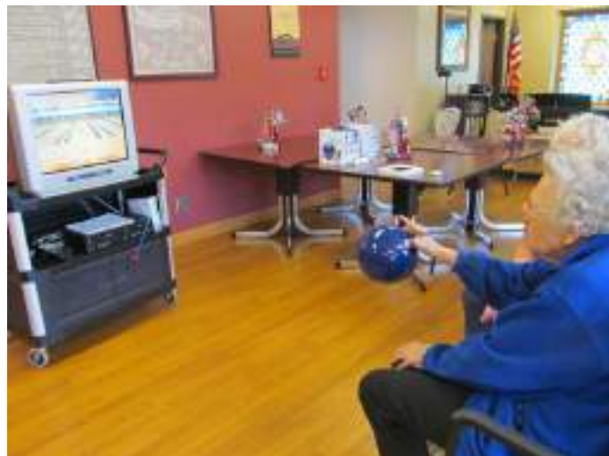
Wii Bowling Excitement...