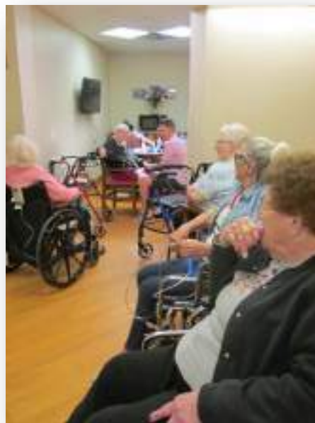
Lined up for Pampered Nail Time...