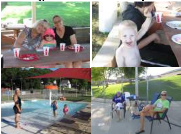
Staff Potluck & Pool Party...